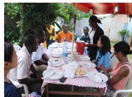
First common meal shared between BWC and VSO volunteers as a sign of a new relationship and solidarity

There was a tour of the BWC Head Office premises including the new volunteer's house and the taking of family photos accompanied by socialization.