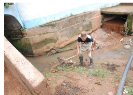
Community activist partnering with BWC to do WASH at the Biyeme River course

In addition to this, the organ handles the task of filling pot holes on the road. This eases the circulation of vehicles. As well, the filling of pot holes discards stagnant water pools on the roads. The initiative is in line with the action plan of global environment facility.