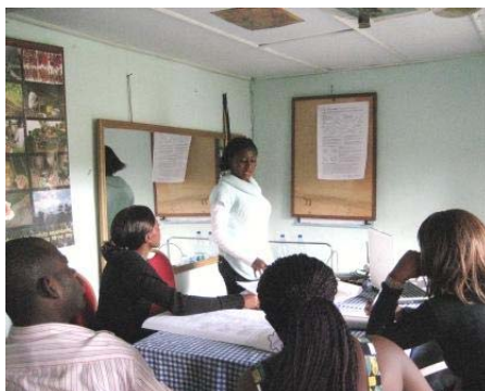
Attentive participants (above and below) during the Permaculture workshop

To create open space for questions and ideas on ecological sustainability