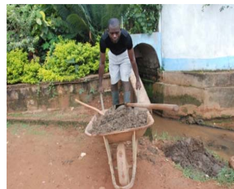
BWC at work for a clean healthy environment

BWC is looking forward to partnering with high technical organizations, in order to develop local innovative techniques that can harness the transformation or the recycling of biodegradable matter collected from the water courses and borders, ahead of clean water and sanitation for the city.