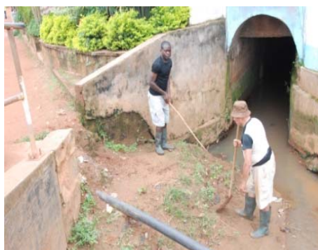
BWC and an urban sanitation activist cleaning the surrounding

BWC is looking forward to partnering with high technical organizations, in order to develop local innovative techniques that can harness the transformation or the recycling of biodegradable matter collected from the water courses and borders, ahead of clean water and sanitation for the city.