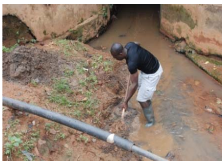
Clearing debris on river course as part of BSNC's slum regeneration programme

The action also involves collecting all the rubbish deposited in the water course and around the borders, in order to make rid of potential dirt that may be poisonous to aquatic biodiversity and humans. The rubbish collected from the flowing streams and borders is heaped and destined to the urban dust bin.