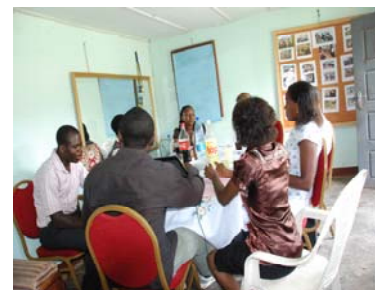
Better Web Site Committee

PUTTING TOGETHER POSITIVE NEWS, WE GET A UNIQUE INSIGHT INTO THE SCALE OF THE GLOBAL EFFORT TO CREATE A SUSTAINABLE, JUST, EQUITABLE, HEALTHY AND FUFILLING WORLD. AS YOU WILL SEE FROM THE ARTICLES ON THIS WEB SITE, IT'S HAPPENING IN PEOPLE'S INDIVIDUAL LIVES, IN COMMUNITIES, INORGANIZATIONS AND EVEN IN BUSINESS AND GOVERNMENTS. FOR THIS POSITIVE MOVEMENT TO SUCCEED, WE MUST ALL REALIZE WE CAN PLAY A PART. OUR TRANSITION APPROACH IN BETTER WEBSITE COMMITTEE SHOWS THERE IS A GROWING DEBATE ABOUT WHAT REALLY MATTERS IN LIFE AND HOW INDIVIDUALS AND SOCIETY CAN REALGN WITH NATURAL LIVING. IN DOING SO WE CAN SOLVE PRESSING PROBLEMS AND ACTUALLY BECOME HAPPIER. BETTER WEB SITE COMMITTEE INVITES YOU TO TAKE INSPIRATION FROM THESE WEB PAGES AND BE PART OF THE SOLUTION.