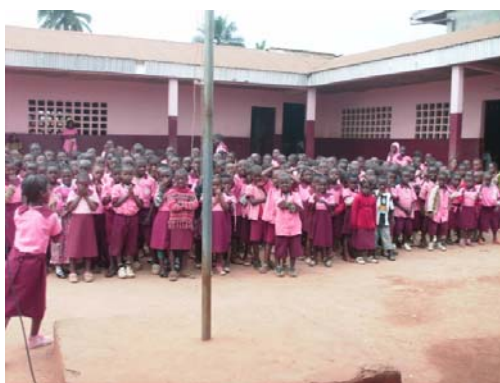
Launching Environmental Education in a primary school to make pupils understand sustainability and environmental issues

W.P.E. has been very much active in executing some of its priority projects in the course of the two previous years, the most successful being the "Projet Ecole" which was designed to cover schools with E.E. (environmental education). This project has covered about a hundred and fifty schools all around Cameroon and has witnessed clear effects in changing and modifying behavior of children towards environmental awareness. Beside the famous "Projet Ecole", W.P.E. has developed alongside another related project, known as the "Green School Project", which is all about planting trees in school environments in the optic of creating good, healthy and beautiful campuses, and the trees serve as a shelter to pupils and students too during outdoor periods and activities but as well help to combat dryness.