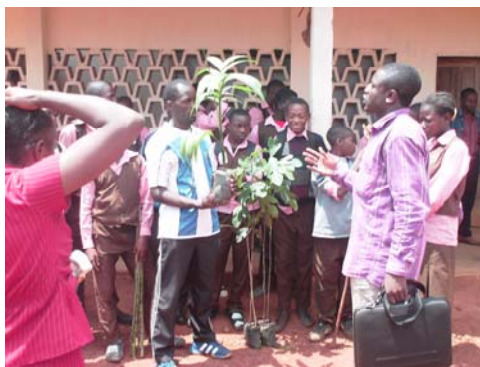
WPE donating some ornamental and shade trees to colleges (above) and teaching tree planting in primary schools (below) in Yaoundé