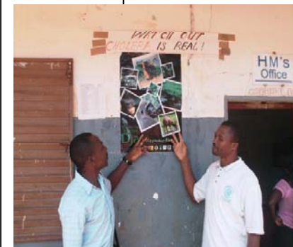
Showing the children pictures of some endangered animal species that need to be protected for the future generation

PLANTING TIP: Get the whole family together to decide which vegetables you want to grow and eat. It is fun to get the kids involved! Kids love to grow pumpkins, radishes and watermelon. Valley View Farms - USA