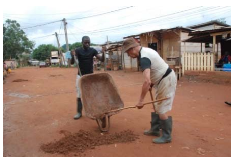
BWC and Partner (community sanitation activist) filling pot holes on the road

In addition to this, the organ handles the task of filling pot holes on the road. This eases the circulation of vehicles. As well, the filling of pot holes discards stagnant water pools on the roads. The initiative is in line with the action plan of global environment facility.