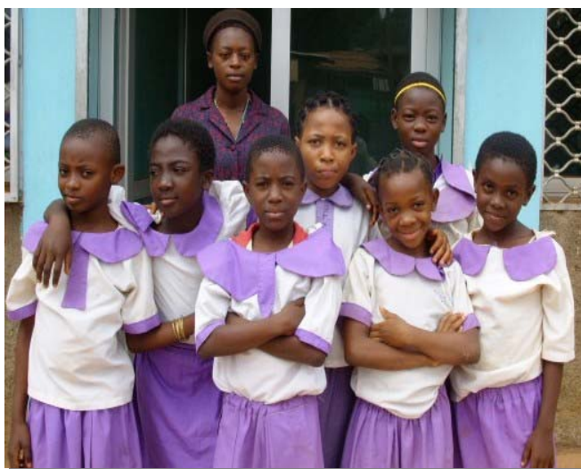
Pupils with their teacher after a lesson of basic computing preparing them for e-classroom

The opportunity to work with partner schools on collaborative curriculum projects which enable learners to interact across geographical boundaries - enhancing their understanding of each other's societies, languages and cultures, and preparing them for life and work in a global society. Professional development for teachers and school leaders, which builds capacity to integrate an international dimension in the curriculum, support international partnerships and work in an international environment. There will be eligibility for International School Award accreditation, which recognises a school's commitment to forming international partnerships and developing global citizens. Advice and support in the use of ICT tools that develop and sustain partnerships, including a range of online teacher forums. Our West Africa region offers a great variety of cultures and traditions, some of them little understood or even known internationally. Connecting Classrooms partnerships with this region provides a platform for young people and educators in other countries to gain real and first-hand knowledge of vibrant and diverse cultures and to challenge any misunderstandings and pre-conceptions.