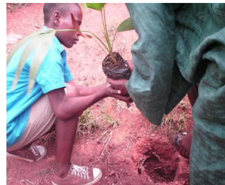
Primary school pupil being taught how to plant

A Memorandum of Understanding between W.P.E. and B.S.N.C. (Better World Students Nature Club) has recently been signed by the two partners. W.P.E. is really very happy about this and hopes for a pleasant and successful collaboration with B.S.N.C.