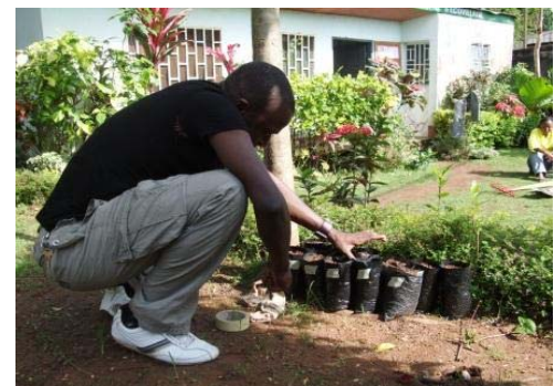
Preparation and nursing of Moringa oleifera seeds