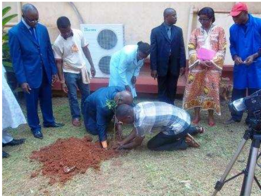
ENAM staff and administrators continue the tree planting while the Director explains to the press the importance of such projects