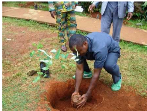
Students taught the importance of trees and encouraged to participate in the tree planting exercise