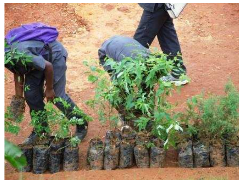
Variety of trees donated to Lycée de Nsam Efulan