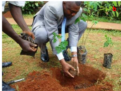
The Principal (a) and teacher (b) setting the pace for the tree planting in the school campus